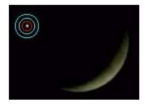
Fig. 1 Venus and the Moon; Venus is with three circles superimposed: the inner circle is the signal's integration area, while in the outer ring's area the background is integrated.