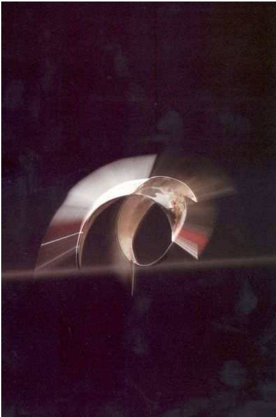
TEST, sculpture by A. Pierelli, photo by S. Takahashi.