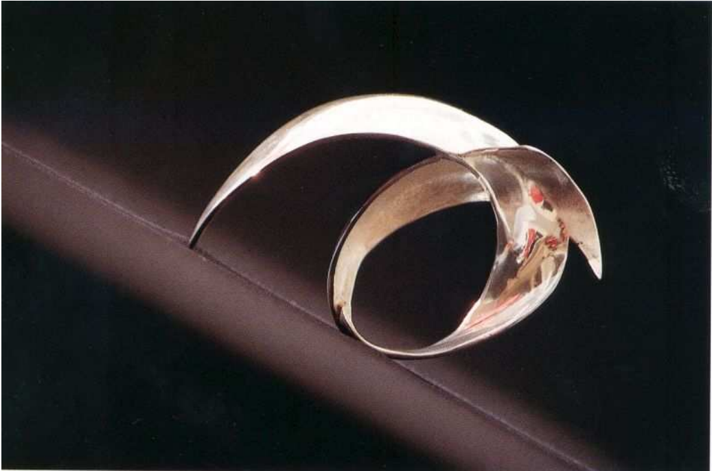
TEST, sculpture by A. Pierelli, photo by S. Takahashi.