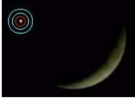
Fig. 1 Venus and the Moon; Venus is with three circles superimposed: the inner circle is the signal's integration area, while in the outer ring's area the background is integrated.